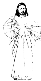
Jesus, I Trust in You All welcome

Speak to the world about My mercy; let all mankind recognize My unfathomable mercy (Diary of St Faustina, 848)