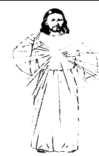
Jesus, I Trust in You All welcome