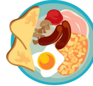
THE MENS BREAKFAST SATURDAY 23rd March in the Café Bar 9.00am onwards Fathers, why not bring your sons with you!

Jesus used strong language to describe the kind of self-denial he had in mind for his disciples. "He who loves his life loses it, and he who hates his life in this world will keep it for eternal life" (John 12:25). What did Jesus mean when he said that a follower of Christ must hate himself or herself? The expression to hate something often meant to prefer less. Jesus says that nothing should get in the way of our preferring him and the will of our heavenly Father above all else. St. Paul reminds us that "what is sown in the earth is subject to decay, what rises is incorruptible" (1 Corinthians 15:42). Do you believe in the power and victory of Christ's saving cross and resurrection? And are you ready to reject whatever is contrary to God's commands and to trust him for the strength and joy to embrace his will for your life?