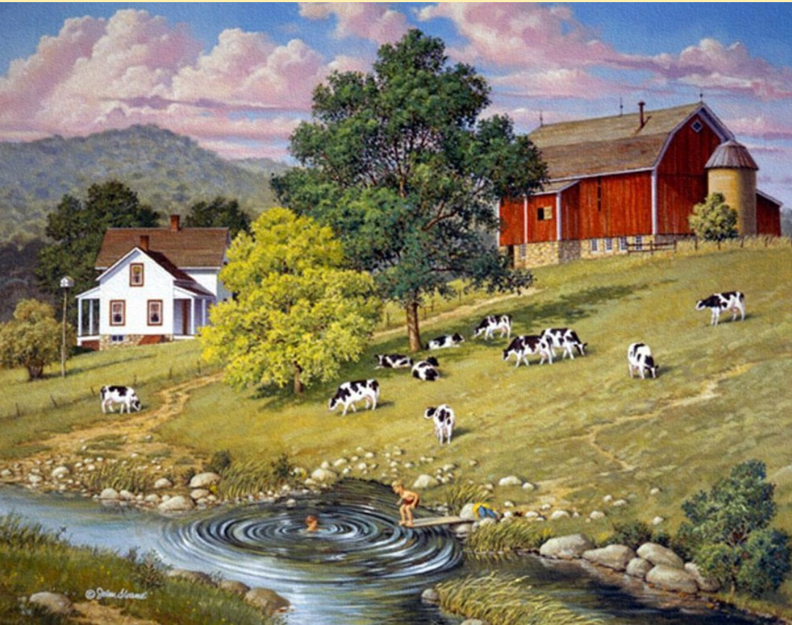
Summer farm scene

“Everything good, everything magical happens between the months of June and August.” – Jenny Han