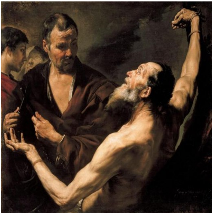
The Martyrdom of Saint Bartholomew (Jusepe de Ribera, 1634)

Often Portrayed As: Elderly man holding a tanner's knife and a human skin; skinless man holding his own skin.