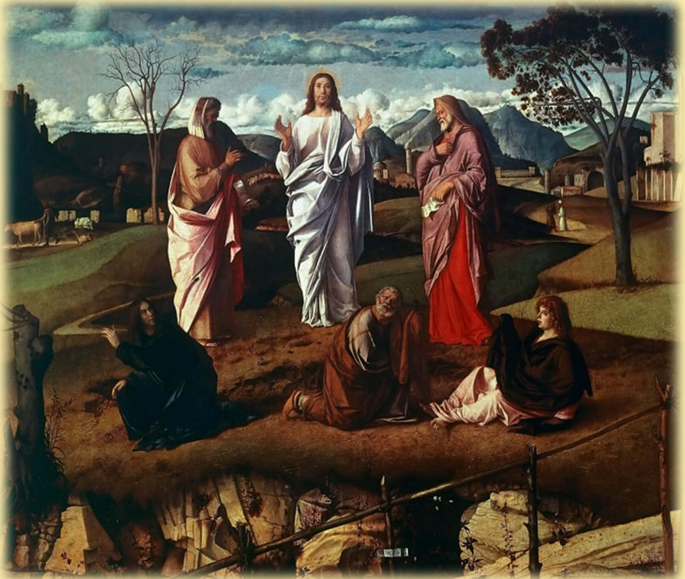
The Transfiguration of Jesus

The Parish Magazine of St. Joseph's Catholic Church, Wembley Summer 2022